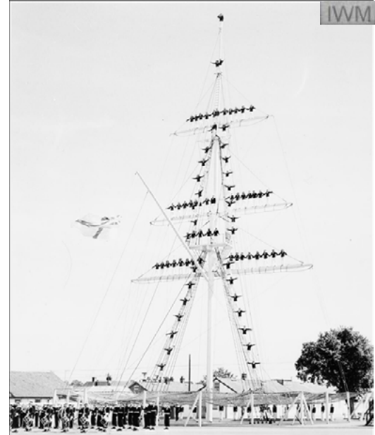
Mast manning at HMS Ganges.

Volunteers receive free Museum Membership, a discount on items purchased from the Museum Shop and Free Parking at the Marina.