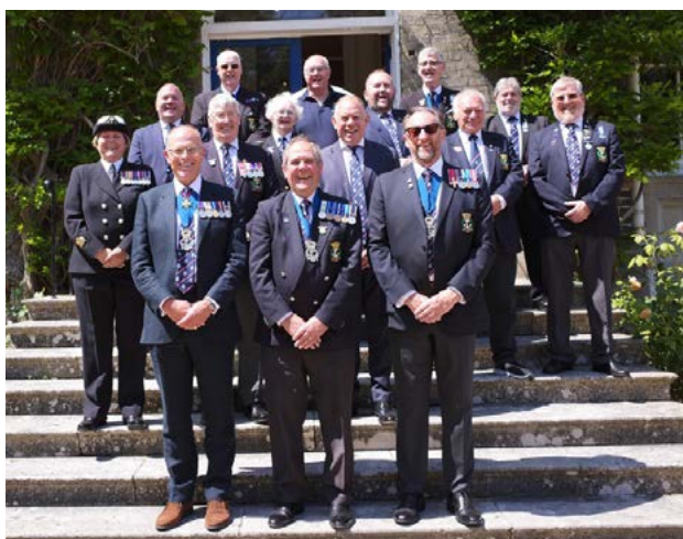
Members of the National Council gather at Portsmouth Naval Base during the RNA National Conference in Portsmouth last summer

The working party engaged with the Privy Council and other charities with Royal Charters to understand the process, then took a close look at the current Charter and Rules,